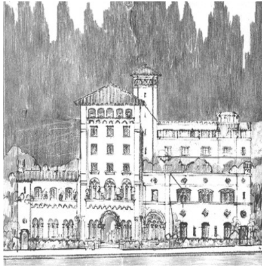
1929 Original Drawing Berkeley City Club Julia Morgan, Architect